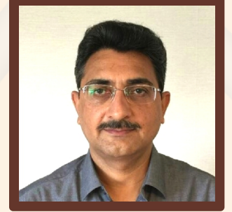
Shri. Rajiv Jalota (IAS)

Hon'ble Minister of State Higher & Technical Education