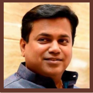
Shri. Uday Samant

Hon'ble Minister Higher & Technical Education