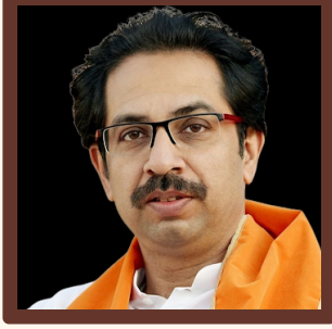
Shri. Uddhav Thackeray