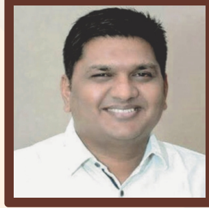
Shri. Prajakt Tanpure

Hon'ble Minister Higher & Technical Education